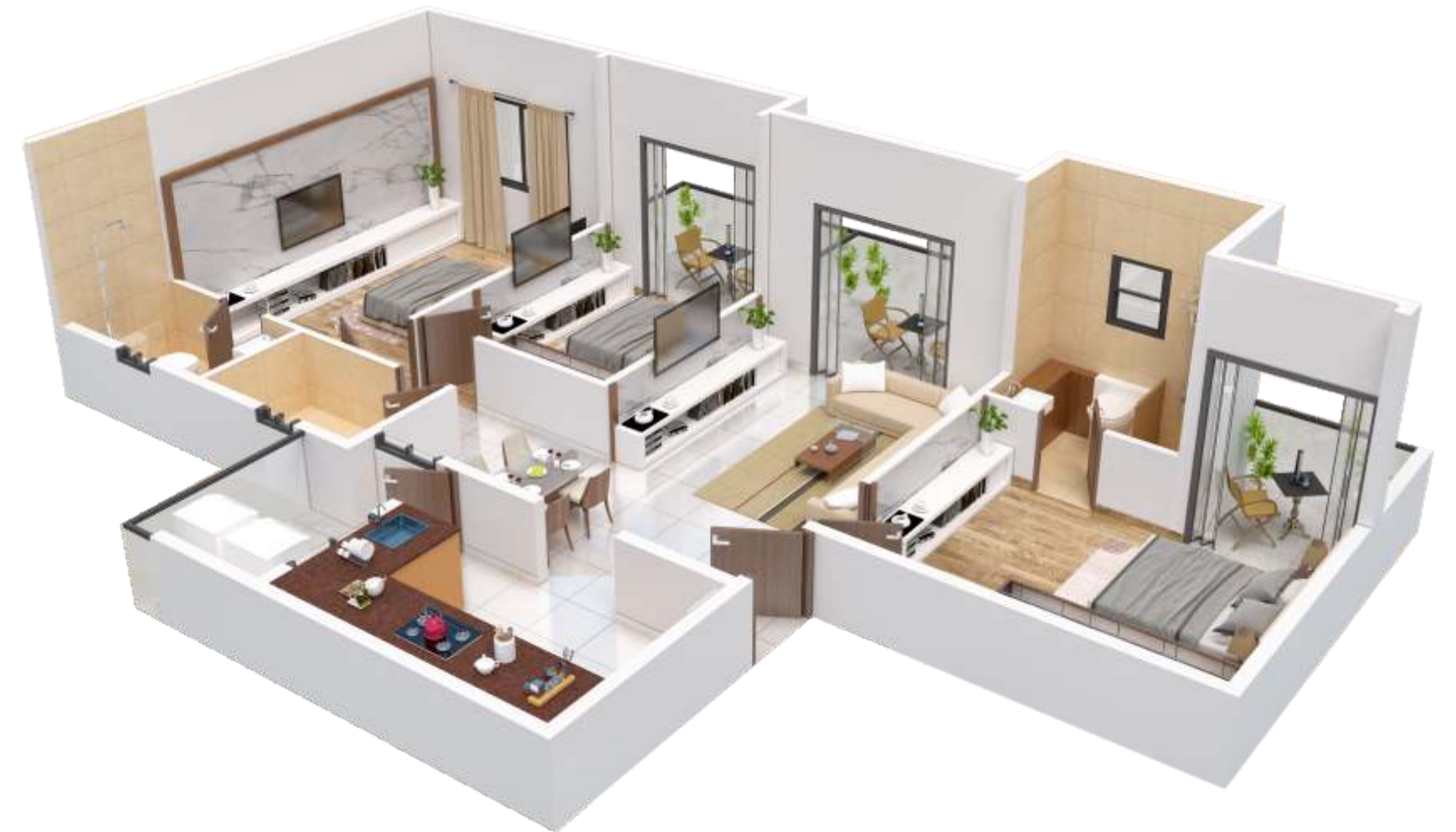
3 BHK LAYOUT PLAN