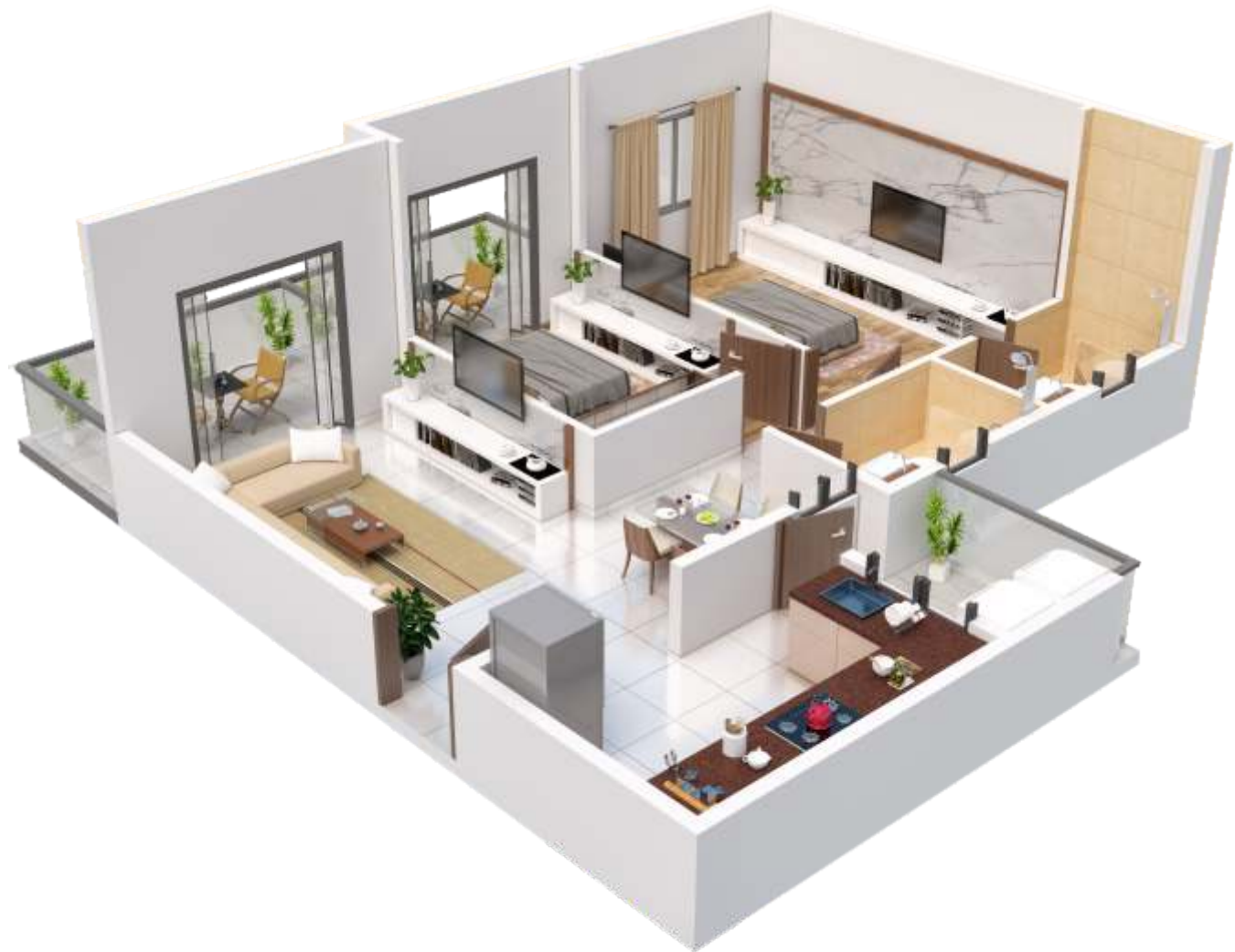
2 BHK LAYOUT PLAN